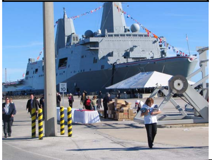
USS SAN ANTONIO (LPD-17)